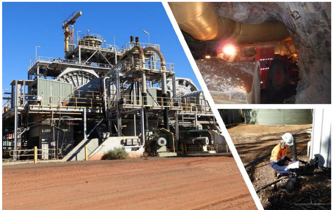
Poseidon Nickel Operations.